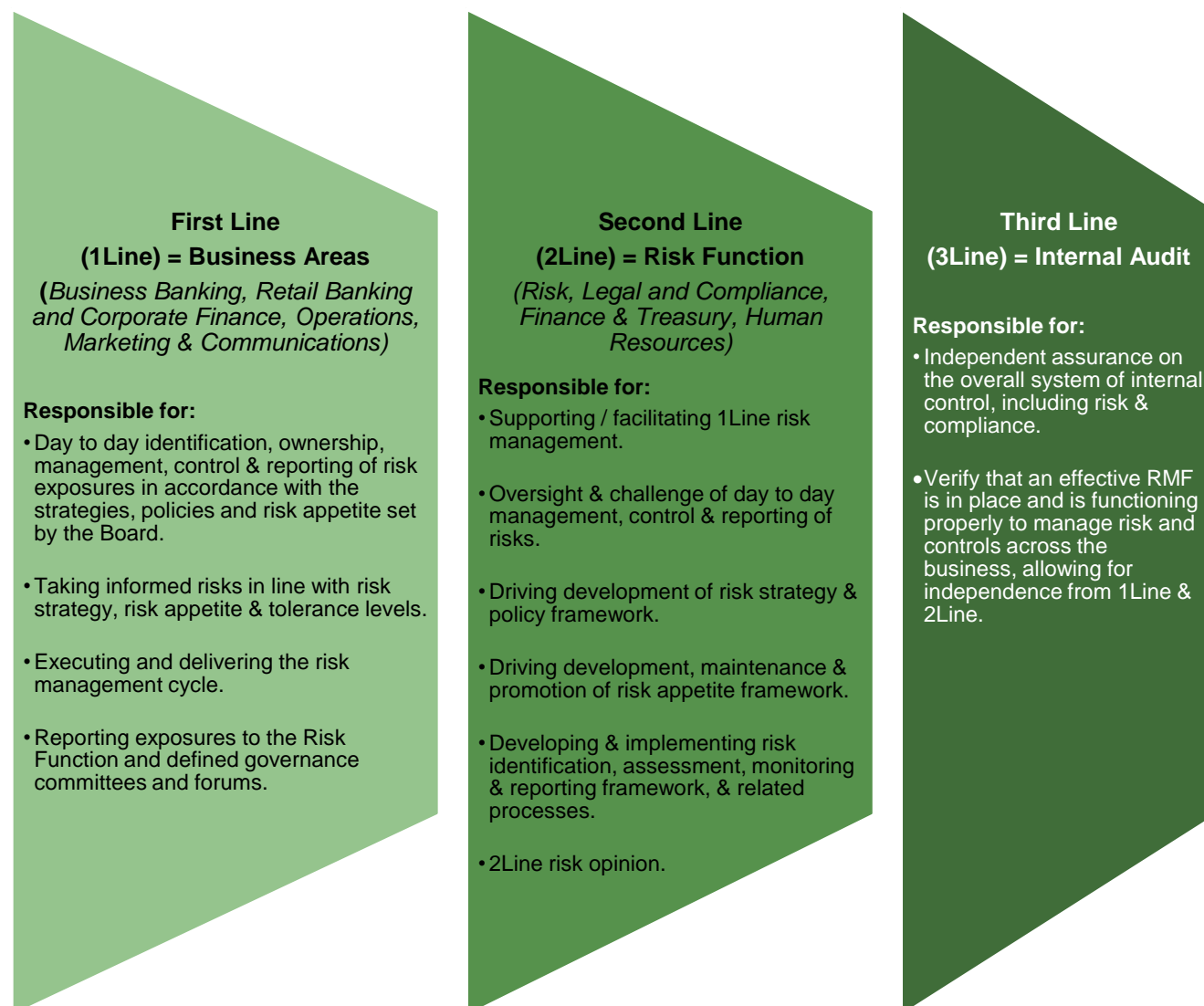
Figure 2: Three Lines Model